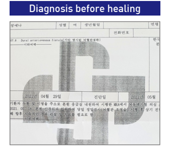
Arteriovenous malformation is seen.

Suspected cerebral artery malformation was observed in the MRA performed after visiting the emergency room of the hospital for the above patient's headache and tinnitus. On May 18, 2021, he was admitted to the neurosurgery of the hospital and was diagnosed with the above diagnosis after performing a detailed examination (Cerebrovascular angiography) on the same day. This requires continuous follow-up and treatment in the future.