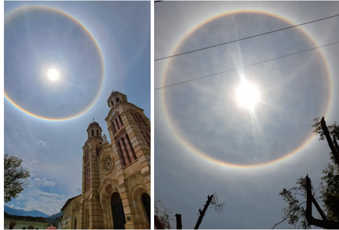
On March 1, beautiful rainbows appeared in Onzaga, La Dorada, etc. in Colombia.