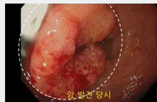
Cancerous tissues found

There are a few acquaintances who wear diapers due to side effects of rectal cancer surgery. I was healed of my rectal cancer without surgery and have been healthy for one year and 10 months. I am so grateful for the grace and love of God the Father.