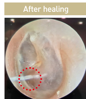
The eardrum looking normal