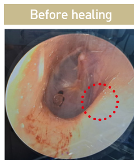
The eardrum is ruptured, with a hematoma around it

When I went to the hospital the next day, the doctor said, "Your eardrum is healing and reattaching well," and suggested we monitor the progress. And a week later during the re-examination, he said, "Oh! The torn eardrum has completely attached." Hallelujah! The doctor also marveled, saying it was a very rare case, and I testified that God had healed it. Even now, about 5 months later, there is no buzzing at all and I can hear normally. In a situation where I had to undergo a major surgery taking about 3 hours, Father God perfectly healed me. I give all thanks and glory to Him.